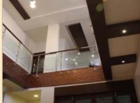
Some of the major applications of this product: